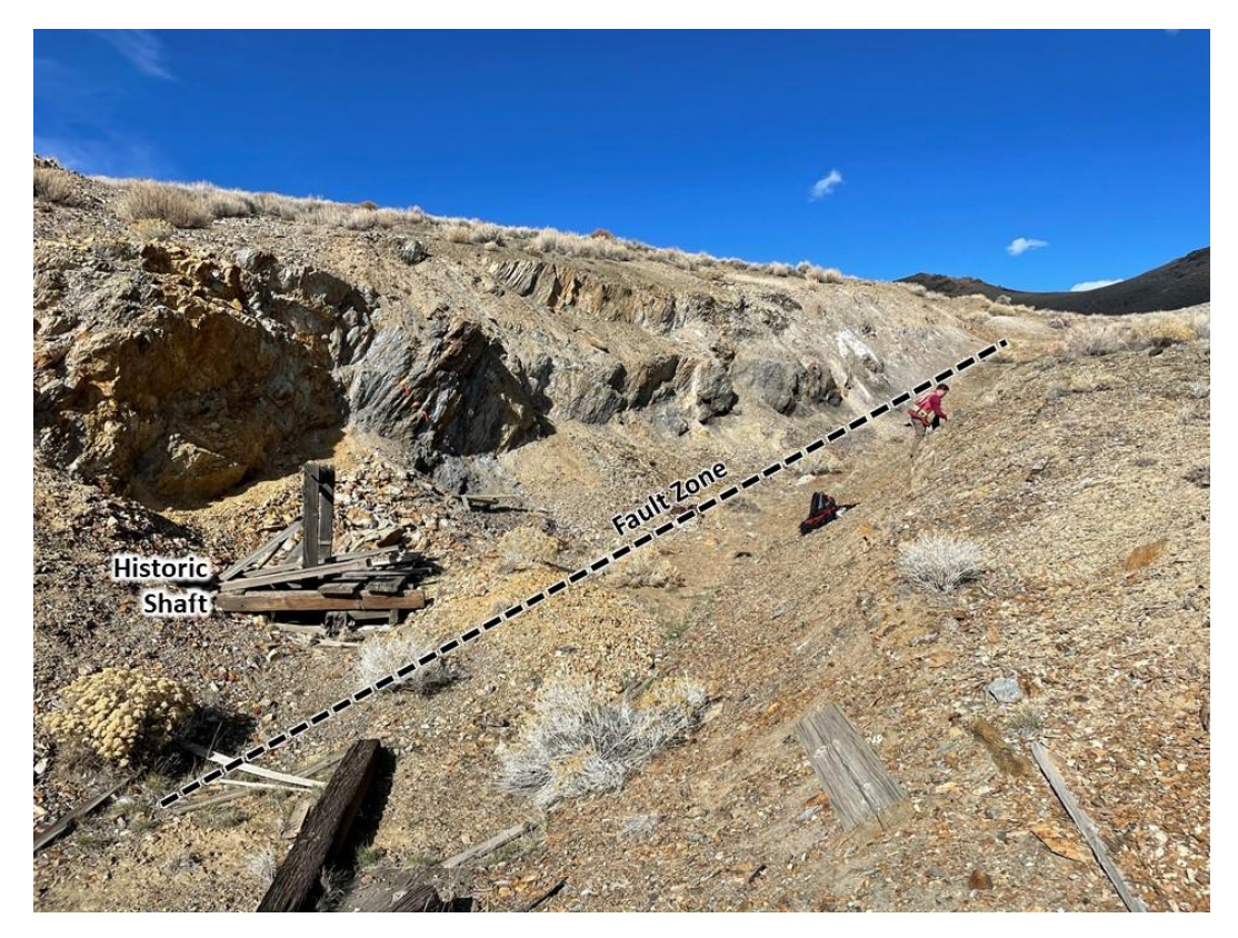
Photo 4: The 60m long trench along the altered fault zone at the Cinnabar prospect.

THE CINNABAR PROSPECT: Located 1.3 km SE of the main Scossa vein swarm, this prospect was staked by Romios in 2020. There is little information available on this showing but workers in the past excavated an impressive 60m long trench along a highly altered fault zone beside a historic small shaft (see Photo 4). The low-temperature mercury mineral cinnabar is visible in small quartz veins along this fault and our samples returned assays up to 3.1% mercury. Cinnabar is commonly found in the uppermost part of epithermal gold-silver vein systems above the level of the precious metals. The results from this prospect suggest that is the case here and there could well be a gold-silver zone at shallow depths below.