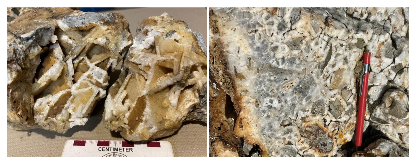
Photo 1 (left): Spectacular quartz-lined open boxwork texture from the Angel Wing vein, indicative of the boiling zone in vein formation. Photo 2 (right): Chalcedonic and drusy quartz infilling breccia vein, Scossa 1-12 vein.

Past mine production was from 5 epithermal veins concentrated in a 650m long x 450m wide area. Individual veins vary from 350m to more than 550m in length. Some of these veins have only been tested with 2 short drill holes and 2 of the shorter veins have had no drilling at all.